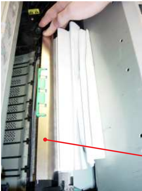
Paper stuck in the area under the toner. Accessed by opening the access door under the toner.

While the toner is out, check under the toner. Paper is sometime accordioned under the access door making it difficult to see until the door is opened. Notice in this example that several pieces are jammed under the access door